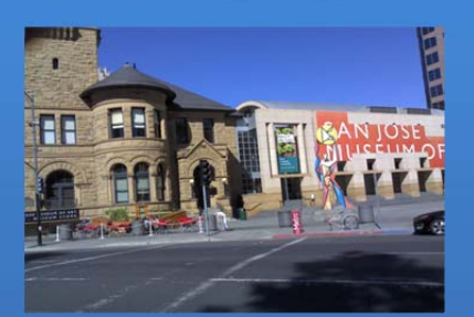
San Jose Museum of Art/ Walking distance of CLEC